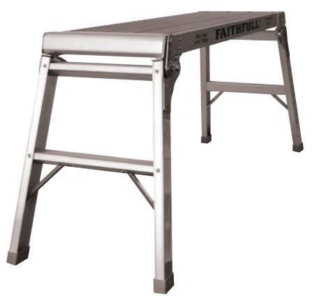
PLEASE RETAIN THESE INSTRUCTIONS FOR FUTURE REFERENCE