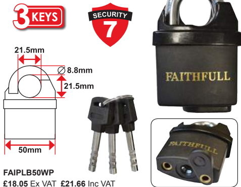
FAIPLB50WP £18.05 Ex VAT £21.66 Inc VAT

This padlock has a brass body with a weatherproof PVC coating. The shackle is made from hardened steel. It has an eight pin tumbler lock mechanism, is double locking and has a self locking action. Supplied complete with 3 keys. More than 10,000 key differs.