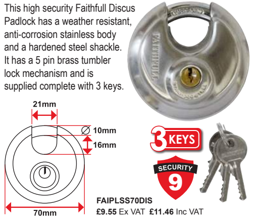
FAIPLSS70DIS £9.55 Ex VAT £11.46 Inc VAT

This high security Faithfull Discus Padlock has a weather resistant, anti-corrosion stainless steel body and a hardened steel shackle. It has a 5 pin brass tumbler lock mechanism and is supplied complete with 3 keys.