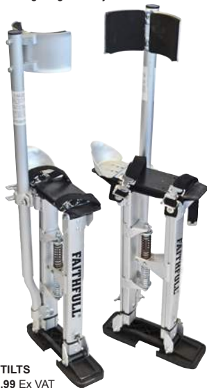
FAISTILTS £218.99 Ex VAT £262.79 Inc VAT

Widely used by tradesmen in the dry wall and suspended ceiling industries, stilts are both a time and labour saving tool. They are designed to eliminate the use of ladders and steps in many building and decorating tasks. Manufactured from lightweight aluminium, they can be fitted in seconds using the quick-release straps and the working height is adjustable in six two-inch increments.