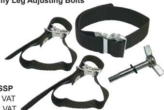
FAISTILTSSP £26.76 Ex VAT £32.11 Inc VAT