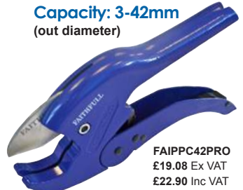
FAIPPC42PRO £19.08 Ex VAT £22.90 Inc VAT