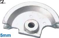
To fit tubes 15mm Inner bend radius 44mm FAIPBM15F £15.89 Ex VAT £19.07 Inc VAT

Aluminium formers for use with the Faithful combination tube bender FAIPBM1522 .