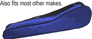
FAIPBMBAG £15.47 Ex VAT £18.56 Inc VAT

Pipe bender carry bag to suit the Combi Bender FAIPBM1522 . Also fits most other makes.