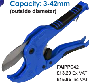
FAIPPC42 £13.29 Ex VAT £15.95 Inc VAT