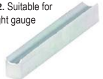
To fit tubes 15mm FAIPBM15G £7.88 Ex VAT £9.46 Inc VAT

Aluminium guides for use with the Faithful combination tube bender FAIPBM1522 . Suitable for copper and light gauge steel tube.