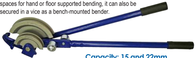
FAIPBM1522 £76.59 Ex VAT £91.91 Inc VAT

The easily carried compact design makes this the ideal tool for plumbers, gas fitters and domestic heating engineers. Suitable for 15mm and 22mm outside diameter copper tube and 15mm light gauge steel tube. Ideal for use in restricted spaces for hand or floor supported bending, it can also be secured in a vice as a bench-mounted bender.