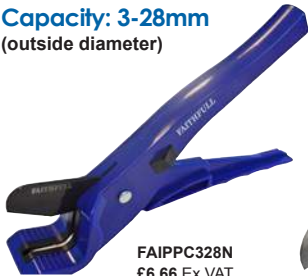
FAIPPC328N £6.66 Ex VAT £7.99 Inc VAT