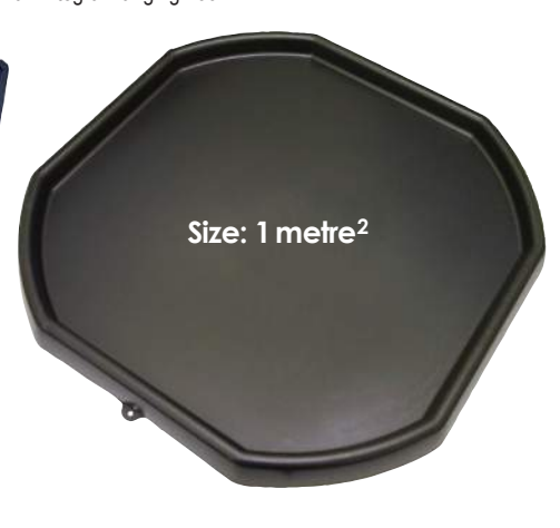
FAISPOTBOARD £24.36 Ex VAT £29.23 Inc VAT

An octagonal shape board designed for mixing cement and other similar products. Restricts spillage and helps keep the worksite clean. Lightweight and easy to move, complete with an integral hanging hook.