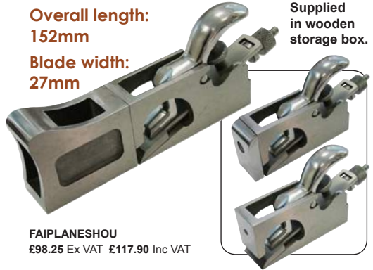
FAIPLANESHOU £98.25 Ex VAT £117.90 Inc VAT