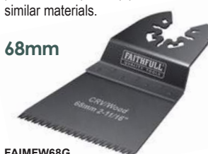
FAIMFW68G £7.39 Ex VAT £8.87 Inc VAT

This fast cutting sawblade has a broad range of applications with ground, side set hardened teeth. Quick cutting performance in soft wood, plastics, plasterboard, plastic pipes and similar materials.