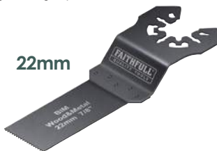
FAIMFWM22 £5.14 Ex VAT £6.17 Inc VAT