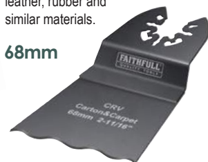
FAIMFSER68 £8.53 Ex VAT £10.24 Inc VAT

This blade has a broad range of applications where a serrated edge is advantageous. This blade saws cardboard, polystyrene, carpet, leather, rubber and similar materials.