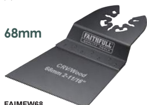
FAIMFW68 £6.24 Ex VAT £7.49 Inc VAT

This sawblade has a broad range of applications with side set, hardened teeth, for fine straight cutting in soft wood, plastics, plasterboard, plastic pipes and similar materials.