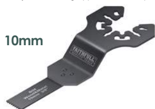
FAIMFWM10 £5.14 Ex VAT £6.17 Inc VAT

The HSS wavy set teeth on this bi-metal blade make it ideal for sawing wood, copper and aluminium pipes, sheet metal, plastics and profiles. Ideal for many flush cutting applications and plunge cutting in plasterboard.