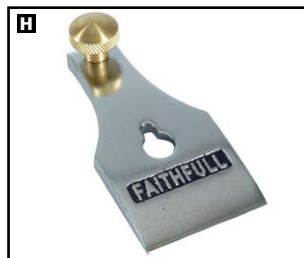
STOCK NO: FAI PLANE4LC LEVER CAP FITS: 4B, 5, 10