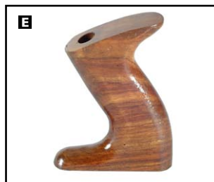
STOCK NO: FAI PLANE4RH REAR HANDLE FITS: 4B