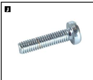
STOCK NO: FAI PLANE4FS FROG SCREW FITS: 3, 4B, 5, 6, 10