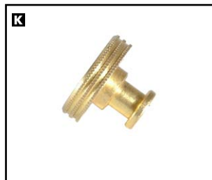
STOCK NO: FAI PLANE4CAN CUTTER ADJUSTING NUT FITS: 3, 4B, 5, 6, 10