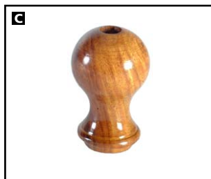
STOCK NO: FAI PLANE4FH FRONT HANDLE FITS: 4B, 5, 6, 10