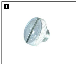
STOCK NO: FAI PLANE4CIS CAP IRON SCREW FITS: 3, 4B, 5, 6, 10