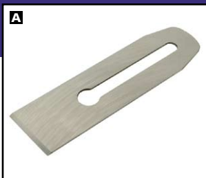
STOCK NO: FAI PLANE4RB REPLACEMENT BLADE FITS: 4B, 5, 10