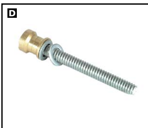
STOCK NO: FAI PLANE4FHS FRONT HANDLE SCREW FITS: 4B, 5, 6, 10