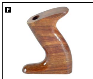
STOCK NO: FAI PLANE5RH REAR HANDLE FITS: 5, 6, 10