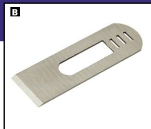
STOCK NO: FAI PLANE60RB REPLACEMENT BLADE FITS: 6012