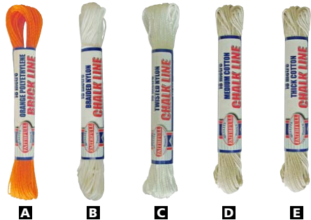
A B C D E