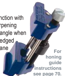
For honing guide instructions see page 70.