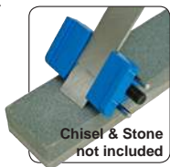
Chisel & Stone not included